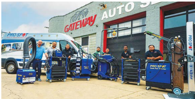
The team at Gateway Auto Service in Chicago was excited to take delivery of new Pro Spot tools.