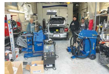
The Gateway team frequently uses Pro Spot's tools.