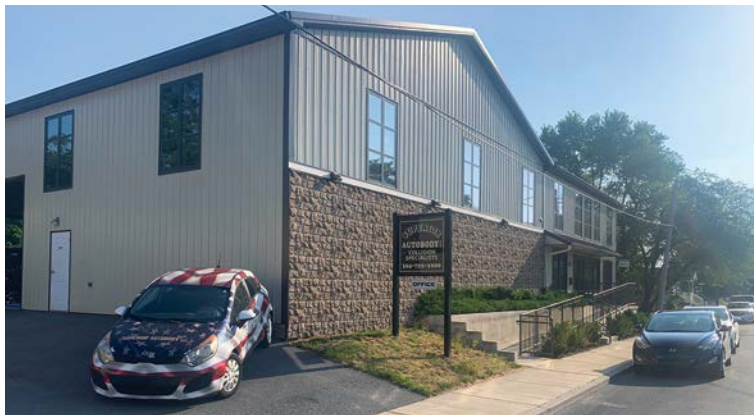
Superior Auto Body proudly serves Jefferson County in West Virginia.

"Our goals and our visions are always to do the right thing – do the right repairs at a fair price," says Bowman. "Everybody makes mistakes at times. But when that happens we're not afraid to own