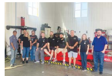
Keeping calibrations in-house means Superior Auto Body employees know the work has been done properly.